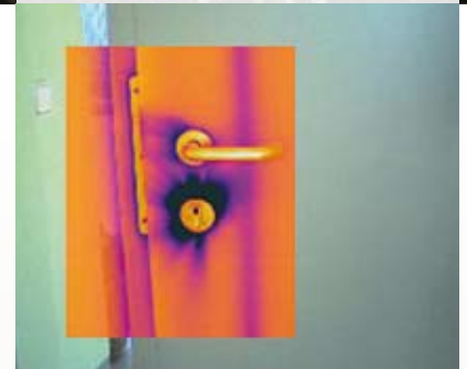
Air leaks in door with considerable temperature difference