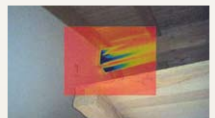
Air leak during blower door inspection, Picture in picture image