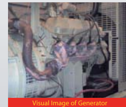
Visual Image of Generator

FLIR's new FUSION functionality allows for easier identification and interpretation of infrared images. This advanced technology enhances the value of an infrared image by allowing you to overlay it directly over the corresponding visible image. This functionality combines the benefits of both the infrared image and visual picture at the push of a button. The T400 camera does this in real-time and the overlay function can be easily adjusted to suit any application such as electrical surveys, building diagnostics, and mechanical inspections.