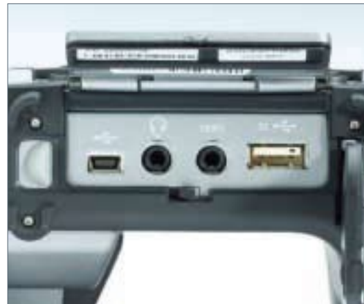
From Left to right: USB mini for PC image download, 4 pole audio for voice annotation, NTSC video, USB-A for memory stick image transfer