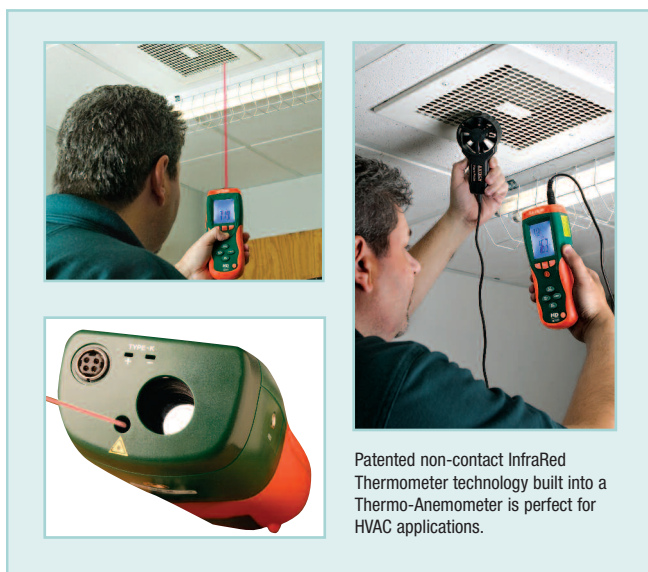
Patented non-contact InfraRed Thermometer technology built into a Thermo-Anemometer is perfect for HVAC applications.