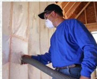
Blow Behind Netting