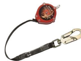
Miller Scorpion Personal Fall Limiter PFL-15/9FT