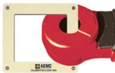
Calibration Check Loop (included)