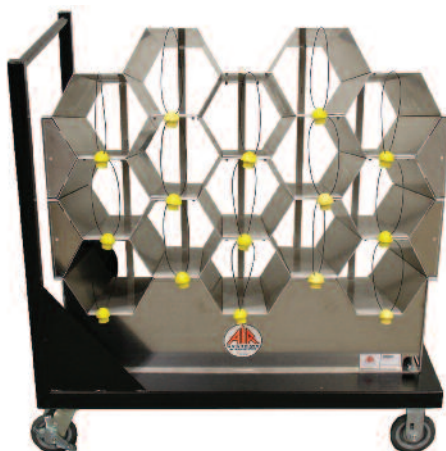
Rack can be ordered with an optional L-Cart for easy transportation