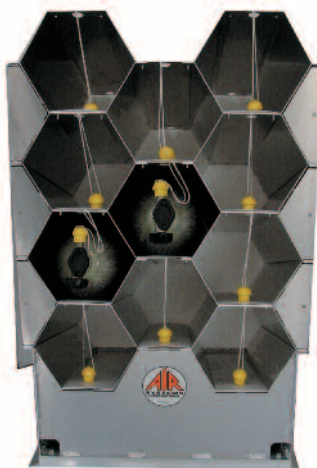
Series 24 Rack Model AK24-11TS

Series 24 is designed to fit in fire/rescue trailers and trucks requiring a narrower profile.