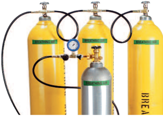
CBF3-346NB Cylinders Not Included

Air Systems' cascade fill assemblies are used for refilling either 2216 or 4500 psi SCBA cylinders. Fill assemblies include a 5 ft. high pressure fill whip with gauge, universal hand-tight nut, on/off and bleed valve. Cylinder connecting whips are supplied with a CGA stem, nut, and tee assembly. Additional cylinder connecting whips can be added to any of the below assemblies for multiple or extended SCBA fill capacity.