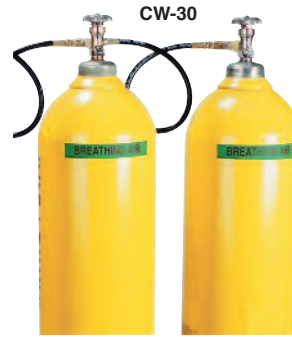
Cylinders Not Included