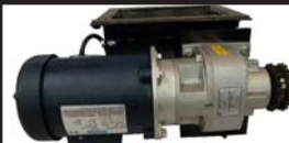
C-face Motor/Gearbox modular replacement.

The 1500 series machine is an economical, compact/portable, high production machine with low power requirements and 'scalping' auger/shredder. The many options: (double blowers, input power, wheel package), offer choices to the small contractor that require versatility, production, and low maintenance in a high endurance machine.