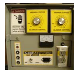
detachable panel box for quick electrical service & repair.