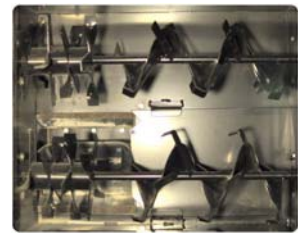
Dual 'scalping' auger/shredders increase fiber conditioning with a non-bridging, metered feed.

A Great Choice for the 'Weatherization Contractor'