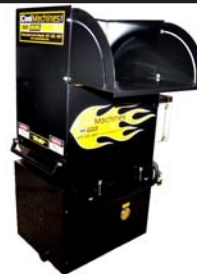
Ergonomic design provides easy loading of fiber without hose 'trip' hazard.