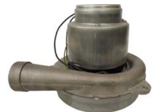
Large (140 c.f.m.) blower provides airflow for maximum coverage (optional: double blower)