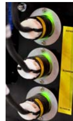
L.E.D. plugs and receptacles for quick electrical diagnostics.