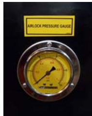
Airlock pressure gauge provides precise dense-pack adjustment & airlock seal diagnostics.