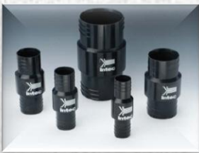
Swivel hose connectors