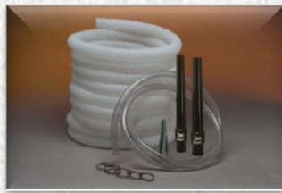
Wall fill kits