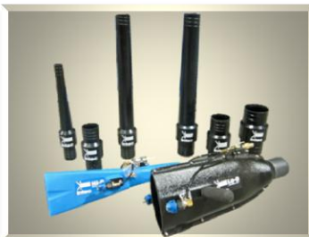
Nozzles & swivel hose connectors