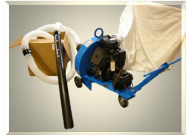
Vacuums & Generators